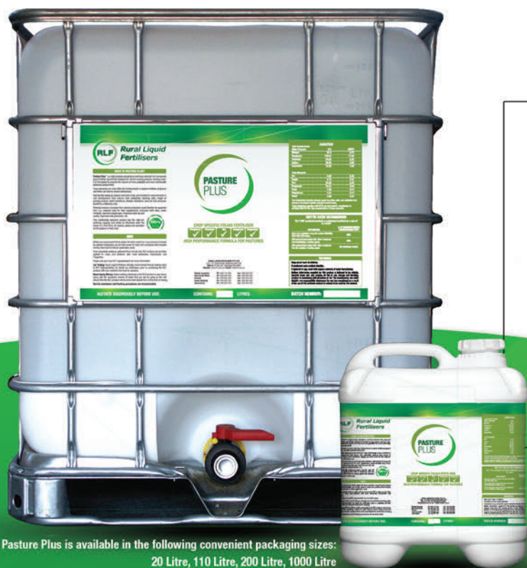
Pasture Plus is available in the following convenient packaging sizes: 20 Litre, 110 Litre, 200 Litre, 1000 Litre

Reduces anemia, improves growth and prevents anorexia.